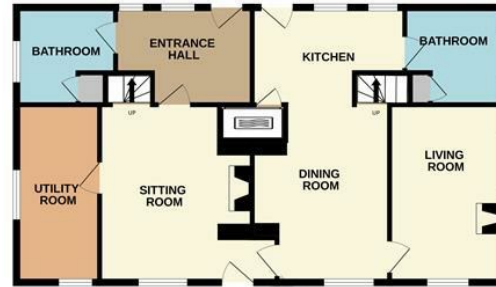
1ST FLOOR 523 sq.ft. (48.6 sq.m.) approx.