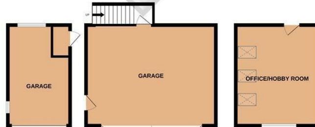
TOTAL FLOOR AREA : 2122 sq.ft. (197.1 sq.m.) approx.

Whilst every attempt has been made to ensure the accuracy of the floorplan contained here, measurements of doors, windows, rooms and any other items are approximate and no responsibility is taken for any error, omission or mis-statement. This plan is for illustrative purposes only and should be used as such by any prospective purchaser. The services, systems and appliances shown have not been tested and no guarantee as to their operability or efficiency can be given. Made with Metropix ©2024